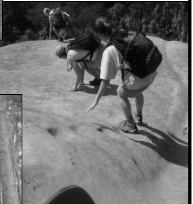
Hiking in Red River Gorge, Kentucky