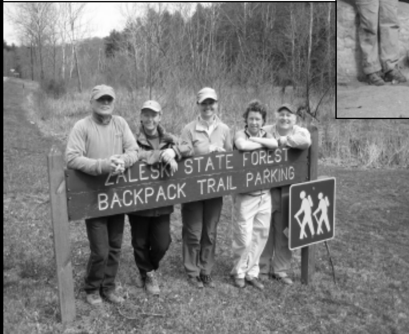
Trail's End at Zaleski State Forest, Vinton and Athens Counties, Ohio