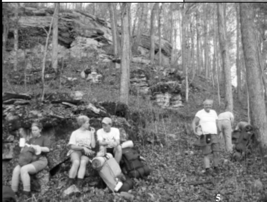
Backpacking at Mammoth Cave National Park, Kentucky