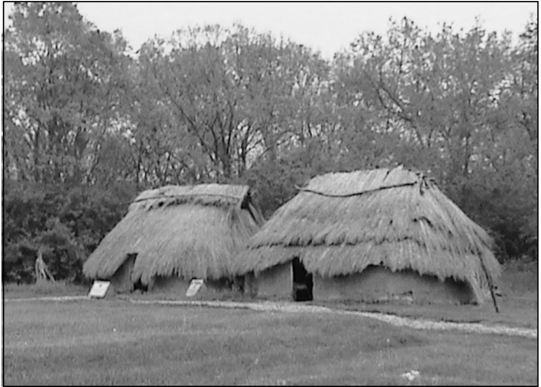
These grass huts were the overnight sleeping quarters for twenty-two MVOC visitors to SunWatch Indian Village in May.