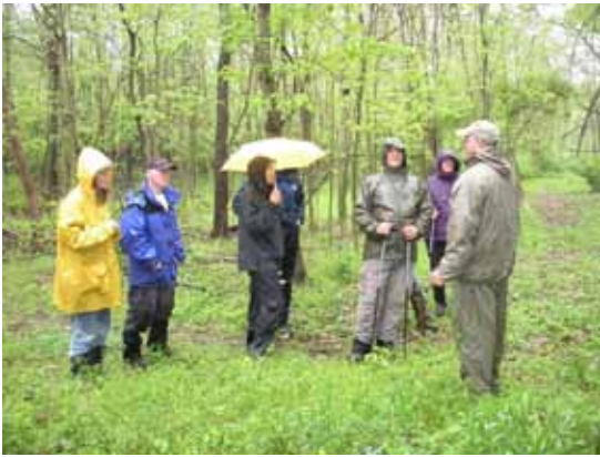
Tour of Shiloh Woods Conservation Area.

the Dayton Hikers, hiked in the rain through ankle deep streams, thick brush, wet grass and mud, but the weather didn't dampen their spirits.