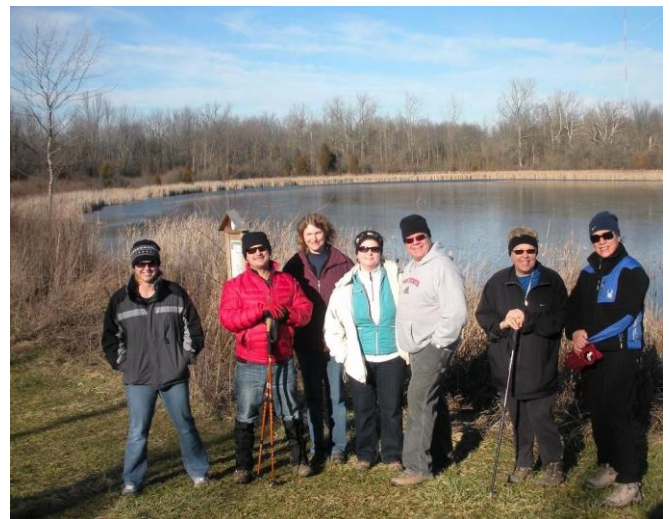
Afternoon Hike at Possum Creek MetroPark. Argonne Lake in the background.